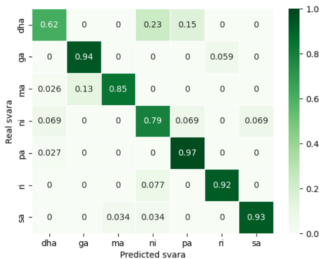
Figure 2: Confusion matrix of test predictions from DeepGRU model. Values represent the proportion of <y-axis svara> predicted as <x-axis-svara>

Our model converges after around 100 training epochs. We evaluate the model using 2-fold cross validation, reporting a test prediction accuracy of 87.6%. Figure 2 shows the confusion matrix for predictions on the test set. Whilst overall the model predicts svara very well, it has most difficulty in classifying dha, particularly in distinguishing it from ni. This might be influenced by the fact that the two svaras are neighbours, and are performed in rāga Bhairavi with a wide range of gamakas, some of which result in similarly shaped pitch curves for ni and dha across a highly similar pitch space.