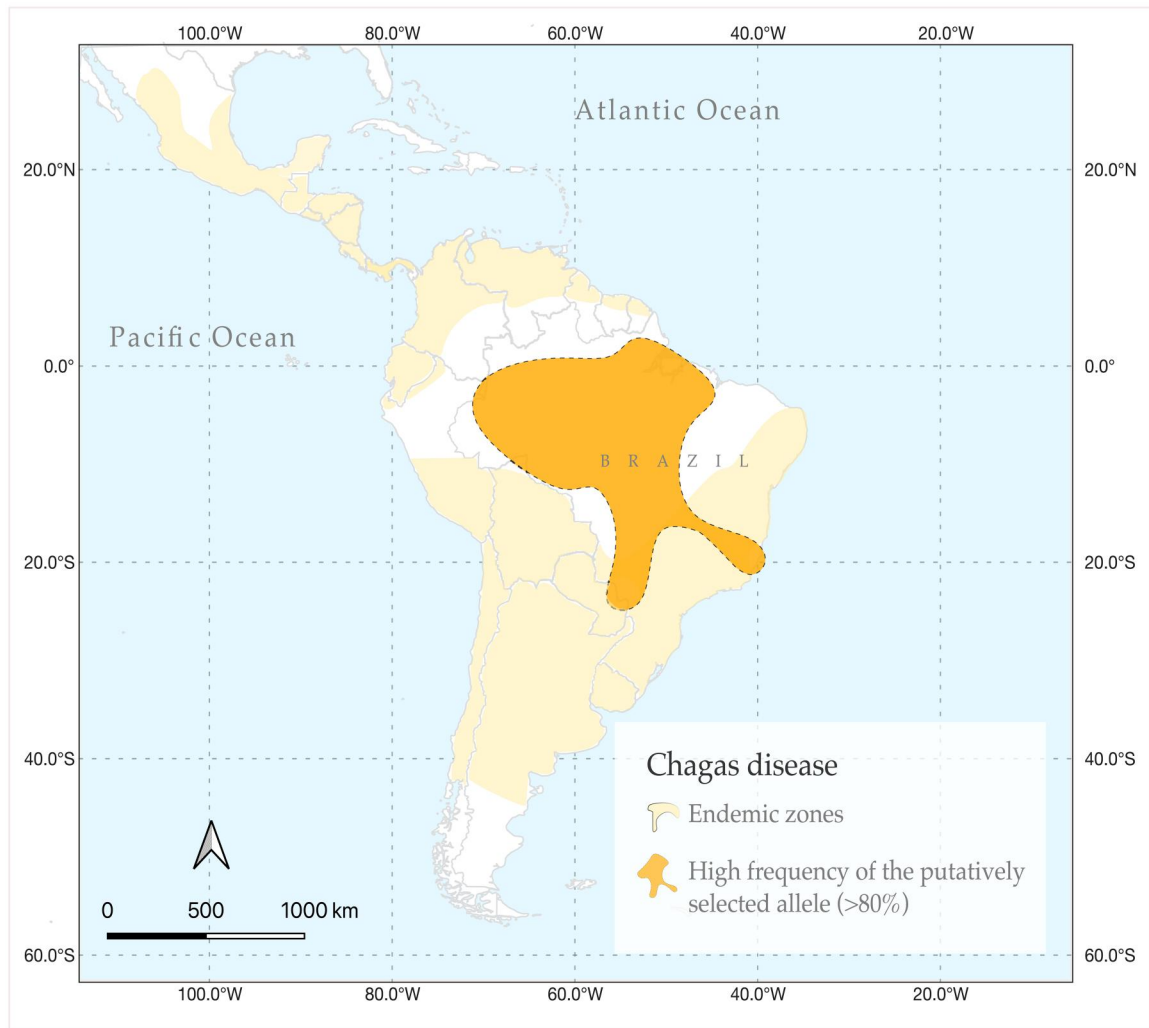
Fig. 3. High-frequency distribution of the putatively selected PPP3CA allele. The yellow area on the map represents the endemic region of Chagas disease. The orange area represents the distribution of the putatively selected allele (rs2659540 G>A) in the studied populations.

hg19 to the current genome assembly, GRCh38-hg38. Individuals with more than 10% of missing data and those SNPs with minor allele frequency (MAF) lower than 5% or with more than 1% of missing data were removed. We further computationally phased the data using SHAPEIT2 (55) and the recombination map files from the 1000 Genomes Project (56) to phase the haplotypes. No reference panels were used because of the peculiarities of evolutionary history and the lack of representation of Native American populations in these panels. We used the ancestral and derived allele information annotated in the 1000 Genomes Project from EPO pipeline (56), according to Ensembl FTP site ( http://ftp.ensembl.org/pub/release-71/fasta/ancestral_alleles/homo_sapiens_ancestor_GRCh37_e71.tar.bz2 ), and removed SNPs without such information so that our final phased and polarized datasets contain 517,984 SNPs.