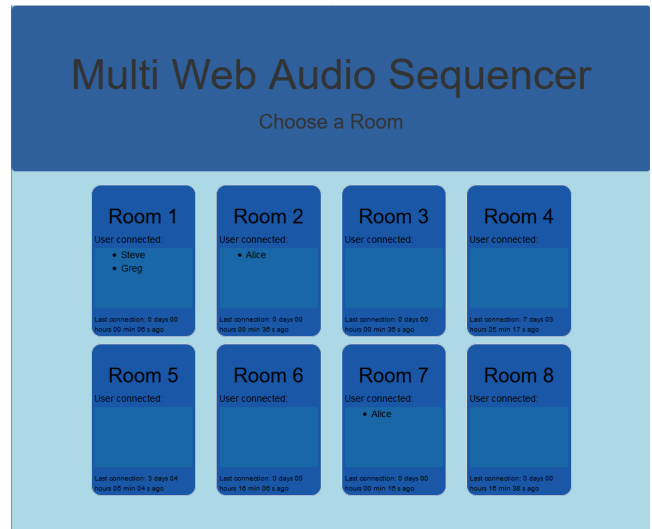
Figure 3: Home page of the application, where users can choose a room to connect to.

A chat allows people to communicate with users connected to the same room and enables them to exchange feedback. We also log the number of users in the room, and the individual connections.