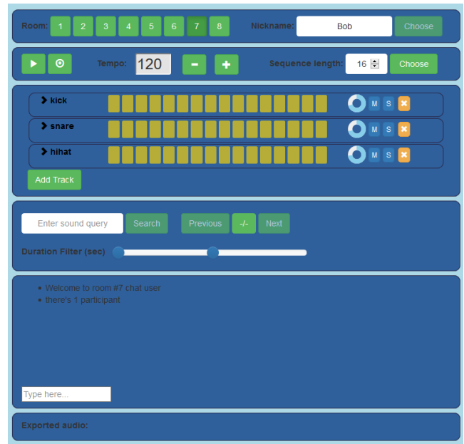
Figure 1: Initial room of the Multi Web Audio Sequencer.

to work on the same piece at the same time, in a more compositional approach. Gurevich proposed an interactive music environment which allows real-time jamming by multiple users through a local network [5]. In his work, he proposed a spatial metaphor characterizing the different layers of interactivity, by defining private, personal, shared and public user spaces.