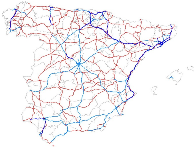
Figure 1. The Spanish system of national roads and highways (2000).

Red: National roads Blue: Dual carriageways Dark blue: highways.